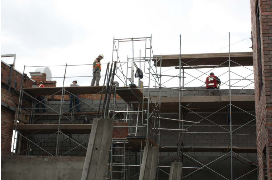
The concrete block wall on the west side of the new museum has risen to the full height of the third floor.

The extension on the east side of the museum is also moving upward. The columns for the extension on the east side of the museum are in place.